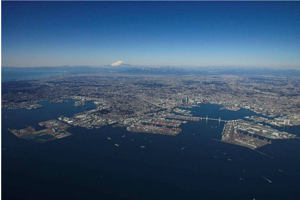
Port of Yokohama

Furthermore, we will proactively attract both domestic and international container ships and cargo to the ports of Yokohama and Kawasaki in order to reinforce the international competitiveness of the Keihin Port (the Ports of Yokohama and Kawasaki).