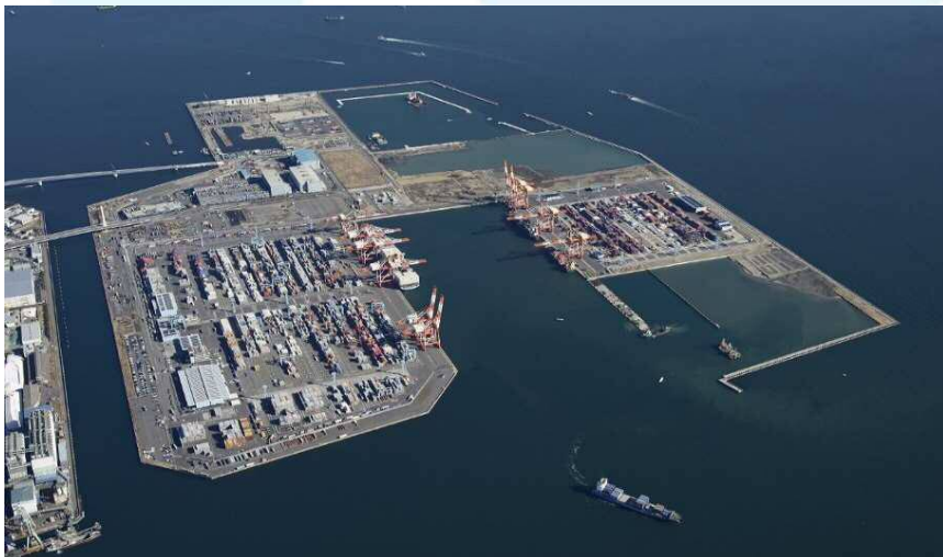
Minami Honmoku Pier

Through these business activities, we will work on development of eco-friendly ports and strong infrastructure vital to economic activities and civil life, in order to contribute to continuous development of our society.