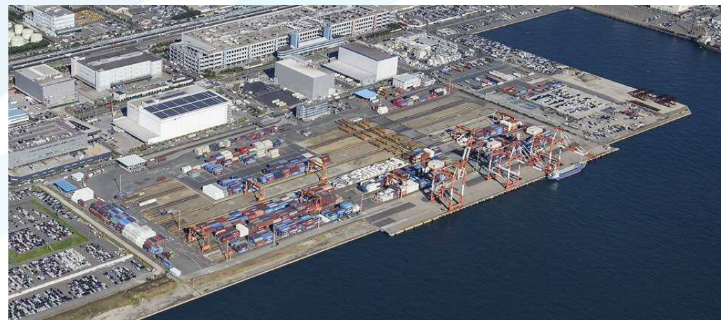
Higashi Ogishima Pier