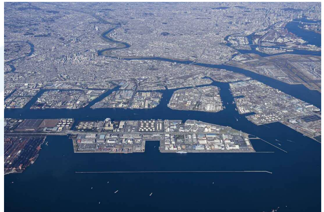
Port of Kawasaki